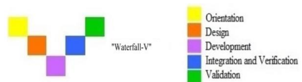
Fig. 2: The “waterfall-V” model

Depending on the product development lifecycle, a specific model may be used. Often, a combination of the “Waterfall” and “V” models is used, represented in Fig. 2.