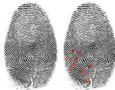
Fig. 4: Fingerprint matching of two images

To take the algorithm in to real application, it needs to overcome the two problems, which are the problem with time cost in getting the finger matching and the determining the local orientation. To apply the proposed program in the real life application, the key obstacle need to overcome is decreasing the time cost in getting the finger matching.