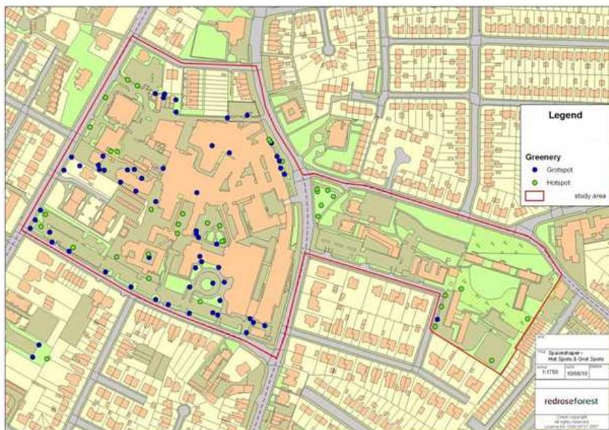
Fig. 2. Hotspots and grot spots