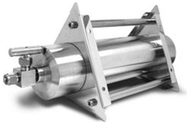
Fig. 1: A tank of hydrogen type HB-SC-0660-N

A group of students at the University of Technology in Eindhoven has created Stella luxury. A machine 4.5 meters in length, as dubious speaks on both the efficiency. All the ceiling is covered with 381 of the photovoltaic cells that would collect energy from the sun. A small battery (of only 15 kWh) charges stationary or at low speed (in maximum 45 min) for a range (autonomy) of 1,000 km. A special software combines the energy stored in the battery with that captured on the way (Meet Stella Lux). At night, with the battery fully charged, Stella Lux keeps 640 km range under ideal conditions (Fig. 3). Because it's made of carbon fiber and aluminum, the car has only 380 kg, which helps to catch 125 km/h top speed.