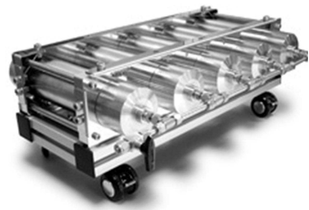
Fig. 2: A device composed of five such cylinders (HB-SS 3300)

The car has already participated in a marathon for solar vehicles. It made 3,000 km with three shortstops charging from the sun. The energy captured in the 3 short charge cycles did not cost anything. But if the captured energy in three charge cycles were taken at night or in bad weather, from a power outlet, the current consumed would have cost 5-6 dollars or the equivalent of about 5 liters petrol. Stella Lux is an intelligent machine that knows how to communicate with other cars and traffic through connection to the mobile phone of the owner. For example, if "hears" a car sirens intervention, automatically lowers the music from the car. And if you have your cell phone on you, you automatically open doors and it invites you inside. For 4 persons, Luxury Stella is very comfortable, everything is thought inside for ergonomics and relaxation, including the parcel shelf from which it operates all machine functions and ambient lights. The most important function is the one that interprets the digital amount of solar energy that can capture the same day. Thus, it can calculate the autonomy that said and you can indicate the best route via GPS, according to the electric charge current autonomy.