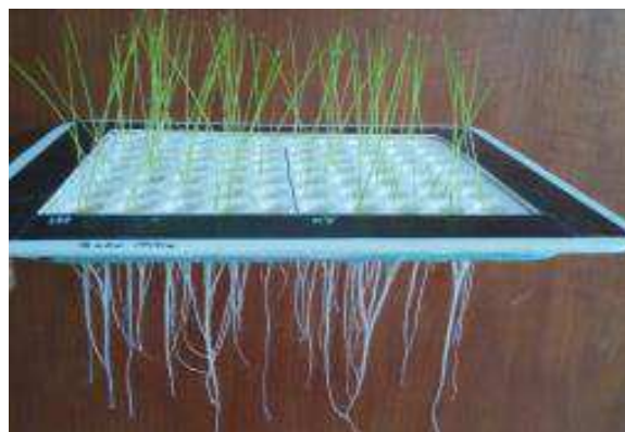
Fig. 1: Performance of cv. Gajah Mungkur (GM) and 28H1 mutant lines grown in medium containing PEG 20%

Grain yield, tiller number, root length and lateral root were used as primary parameters for drought tolerance and compared to negative and positive control. Results showed that 28H1 mutant line provided 12 tiller number and 28,5 cm length of root within selection medium containing 20% PEG (Table 1). The use of Gamma rays to hit cells target created mutation within genomic DNA and it caused alteration of genotypic structures when compared to its previous one. Alteration of genotypic structures can be seen agronomic characters of mutant lines during selection process for drought tolerance. One of mutant lines i.e 20P1 produced 120 grains per panicle when compared to cv. Mira-1 as wild type (Table 1). Mutation provided some advantages for improving agronomic characters of rice mutant line. From 20 rice mutants planted in tube pipe only 2 of mutant lines were lower than their wild type. Plant height of mutant lines of 26G1, 26N1, 30F1 and 37D3 which were 81 cm showed no significant different compared to Gajah mungkur as positive control. These indicate that they are drought tolerant. Related to drought resistant of mutant lines on dry condition, roots are crucial for the successful of mutant lines growth at limited water conditions.