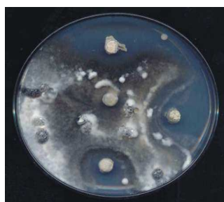
Fig. 1: Bioassay results of Streptomyces isolates against Sclerotinia sclerotiorum . Clockwise from top: Isolate 139, isolate 347, 246 and blank agar disk (control). Center disk is S. sclerotiorum agar inoculum disk. Clear inhibition zones around the Streptomyces agar disks are representatives of lack of growth and bioactivity against the pathogen

Monitoring activity in shaken culture: The results of activity versus time in submerged culture are indicated in Fig. 3. In rotary submerged culture, activity of Streptomyces isolate No. 363 against S. sclerotiorum reached the maximum at 7th post inoculation day. Activity versus post seeding time in submerged media cultures is shown in Fig. 3. Since the activity reaches its maximum after 7th day of post seeding, this time was used to harvest cultures for preparation of crude extract for future investigations.