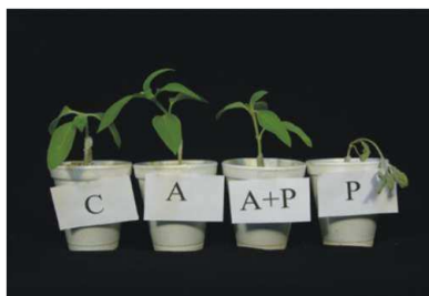
Fig. 4: In vivo greenhouse results in sunflower seedlings (P): In plants inoculated with the pathogen alone and (A+P): Plants inoculated with both pathogen and the antagonist Streptomyces isolate 363, (A): Plants inoculated with Streptomyces isolate 363 alone and (C): Untreated control plants