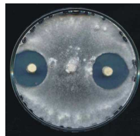
Fig. 2: Bioassay result in Agar Disk-Method of Streptomyces isolate No. 363 against Sclerotinia sclerotiorum . Center disk is S. sclerotiorum agar inoculum disk

*S: Supernatant, *P: Pellet, +: Soluble, -: Insoluble