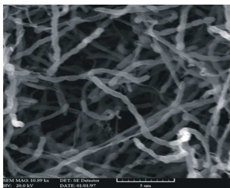
Fig. 5: Digital scanning electron micrograph of spore chains of Streptomyces isolate 363

Determination of TIP: Bioactivity of active isolate diminished to zero at 90°C.